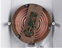
Lifetime measuring technology (pressure loading capacity up to 600 mmHg)

That is genuine Riester quality with lifetime calibration for everyday routine. Available as desk, wall, floor and rail design with complete range of cuffs (bladder cuffs or disinfectable one piece cuffs).