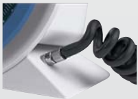
Chromium-plated tube screw connection to allow quick changing of cuffs.

Velcro cuff, adult. round Ri.1453LF square Ri.1456LF