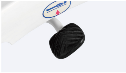
Hydraulic treadle for rise

LEADING BRAND OF CHINA MEDICAL FURNITURE