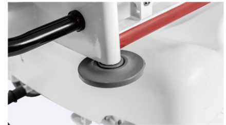
Bumper wheel detachable, max. protect the bed and patient during transportation