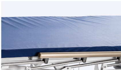
Waterproof PU maffress, convenient for transfer patient

Four double side casters of 6 inch diameter; simultaneously lockable by the step pedal at both sides. TPR tire no worn out after running 30KM, save anti-winding hard shell, united forming without bolts