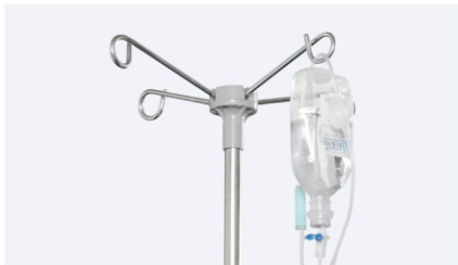
Full SS IV pole, bearing 15kg