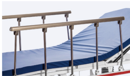
Foldable aluminium alloy guardrail