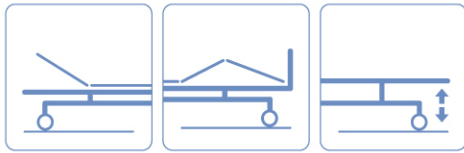
Back-rest Knee-rest Height Adjustment